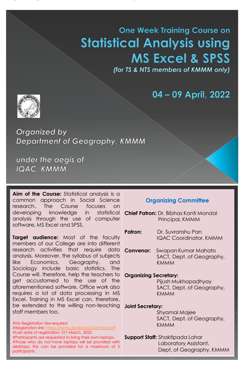
Plate 1: Brochure of the Training Course

A brochure (Plate 1) was circulated among the Teaching and Non-Teaching Staff members of the College regarding the Course and the tentative programme schedule. A registration link was also shared such that the members willing to participate in the Course could register.