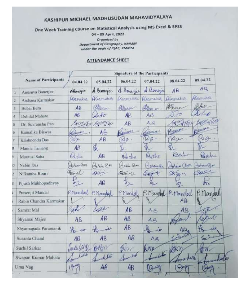
Plate 5: Attendance Record