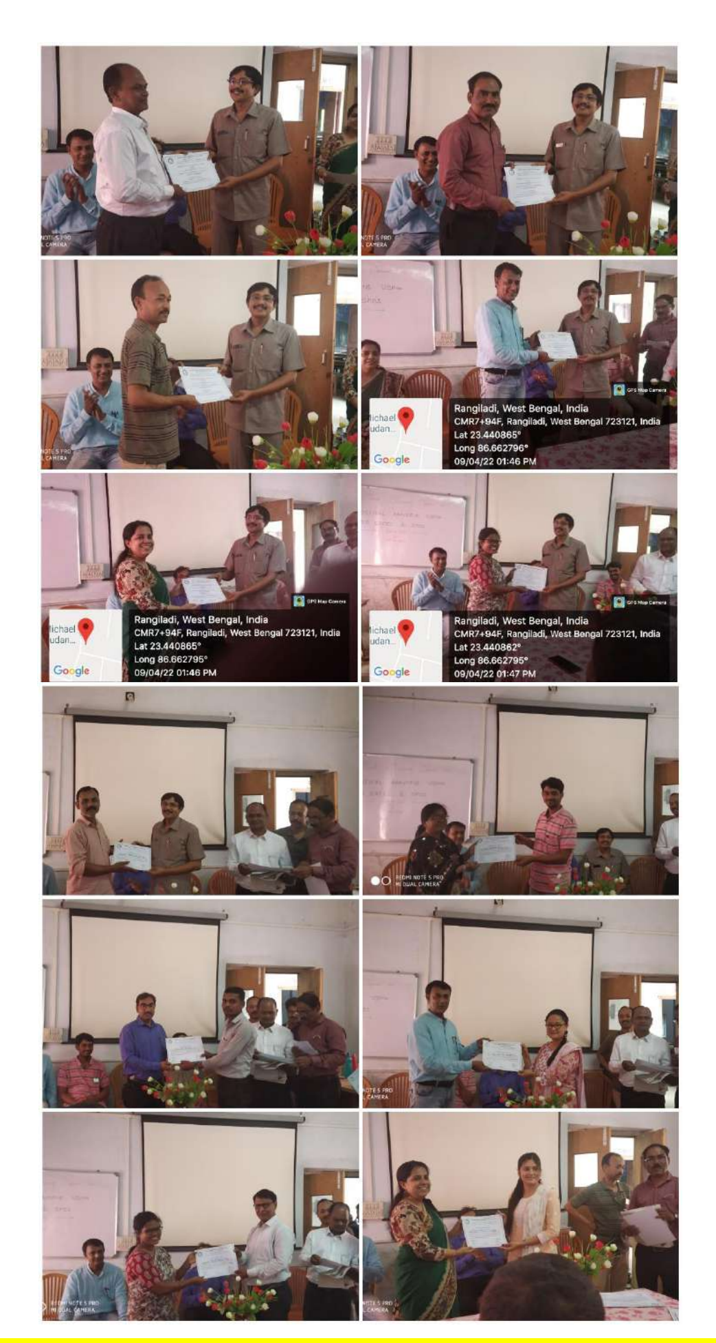
Plate 7: Distribution of certificates to the Organizers, Resource Persons & Participants